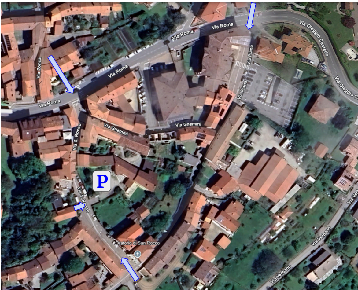
Map with access points from Via Roma and Via Oleggio Castello

Turn left onto Via Piana, then at the first junction turn right onto Via San Rocco - the car gate will be about half way up, on your right hand side.